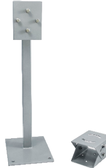
M1-Mounting bracket (long) with half pan/tilt