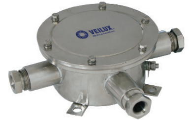
SVEX-JXD assist equipments of explosion proof television and communication system.