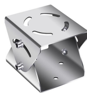
SVEX-M1 Wall Bracket with Mount Adapter