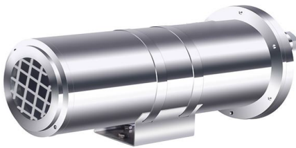
Ex Housing for thermal camera