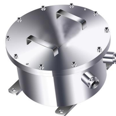
Ex Control Box